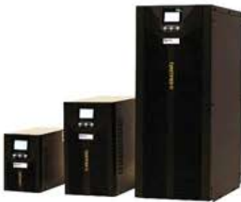
Online UPS 1 KVA - 20 KVA