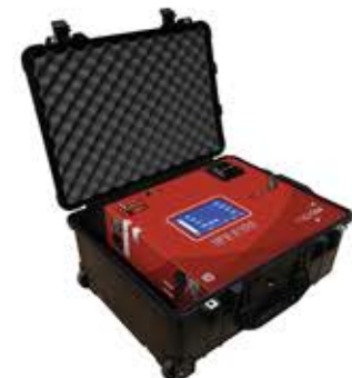
SF6 Gas Analyzer