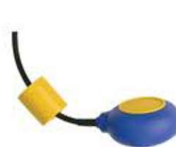
Submersible Float Level Switch