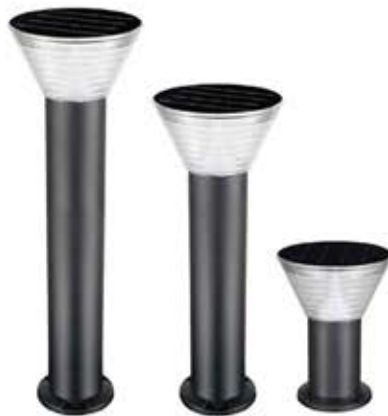
Solar Lawn Light