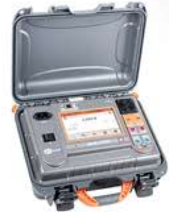
Micro-Ohmmeters (10 A up to 200 A)