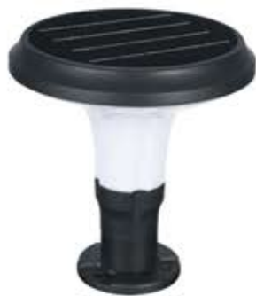
Solar Pillar Light