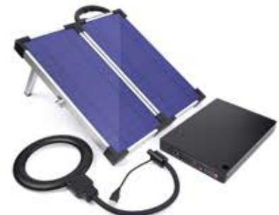
Portable Solar Light Kit