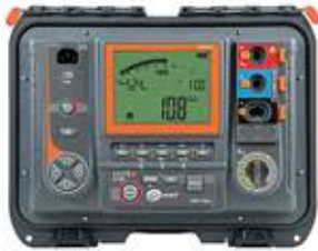
Insulation Resistance Meters (1KV up to 15KV)

شركة SONEL البولندية من الشركات الكبيرة في السوق الأوروبية والمتخصصة في تصنيع أجهزة القياس والاختبار عالية الجودة