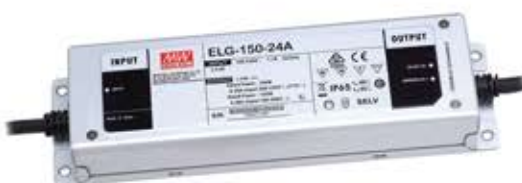
IP67 LED Driver