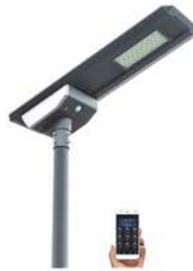
NH All in One Solar Street Lighting