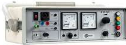
DC Hi-Pot Tester (25 KV up to 120 KV)