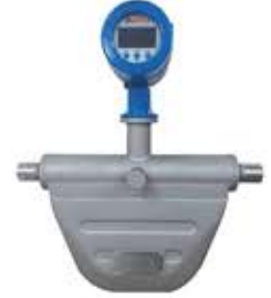
Coriolis Mass Flowmeter