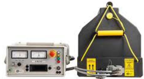
VLF Hi-Pot Tester (24 KV up to 57 KV)