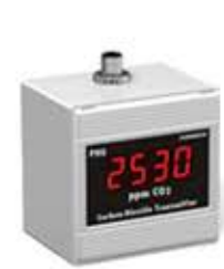
CO2 Probe Transmitter