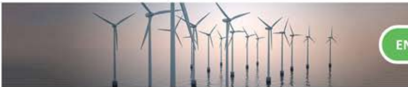
ENERGY GENERATION AND TRANSMISSION