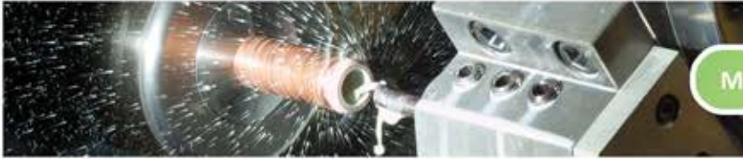
MACHINERY AND PLANT CONSTRUCTION

شركة BD Sensors الألمانية هي واحدة من أكثر الشركات التي تقدم حلولاً مبتكرة في إنتاج أجهزة قياس الضغط الإلكترونية في العالم