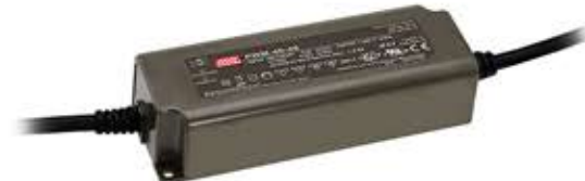
Dimming LED Driver