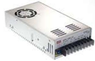
Programmable Battery Charger