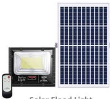
Solar Flood Light