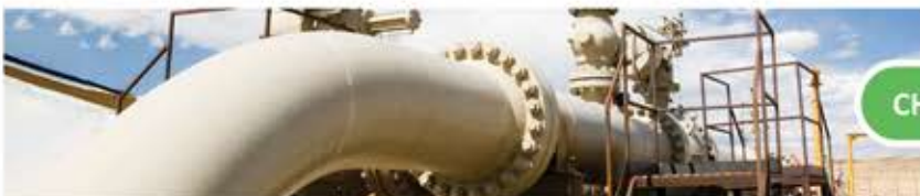
CHEMISTRY / PETROCHEMISTRY INDUSTRY