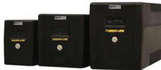
Line Interactive UPS 650 VA - 3 KVA