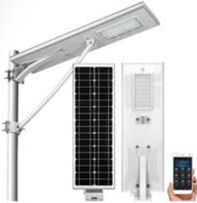
NSP All in One Solar Street Lighting

AGEC offers different types of solar LED lighting systems تقدم شركة AGEC أنواعاً مختلفة من أنظمة الإضاءة الشمسية (LED)