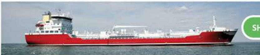
SHIPPING AND YACHT CONSTRUCTION