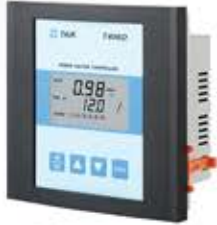
Intelligent Reactive Power Regulators

شركة TAIK ELECTRIC هي شركة متخصصة في تصنيع وتطوير أجهزة القياس الالكترونية المختلفة