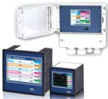
Controller & Data Logger