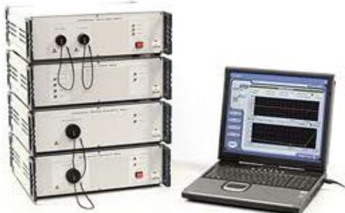
Transformers, Motors and Generators Test Equipment