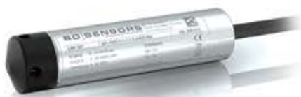
Hydrostatic Level Transmitter