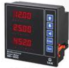
Multifunction Power Meter

شركة COMECO البulgارية هي شركة متخصصة في تصنيع العدادات والمبينات وأجهزة القياس المختلفة (درجة الحرارة - الرطوبة - الضغط - المستوى - التصريف)