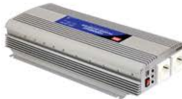
Modified Sine Wave