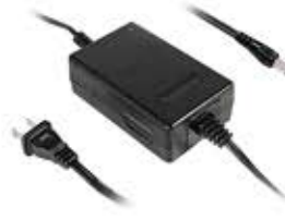
Adaptor Battery Charger