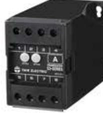
AC Power Transducer