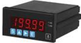
Digital Panel Meter