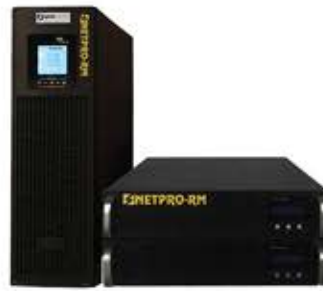
Online UPS 6 KVA - 10 KVA