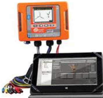
Power Quality Analysis