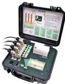
Circuit Breaker Analyzer