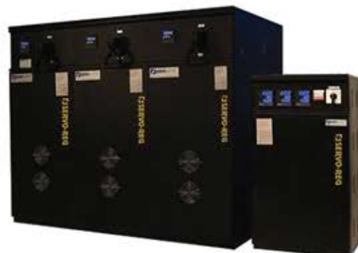
Three Phase Voltage Stabilizer 10 KVA - 3000 KVA