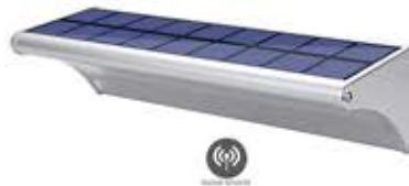
Solar Wall Light