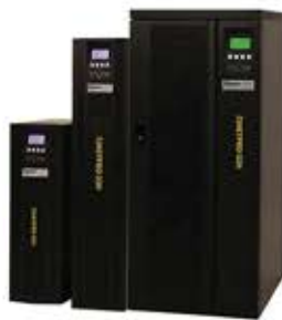
Online UPS 10 KVA - 40 KVA