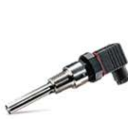
Conductivity Probe Transmitter