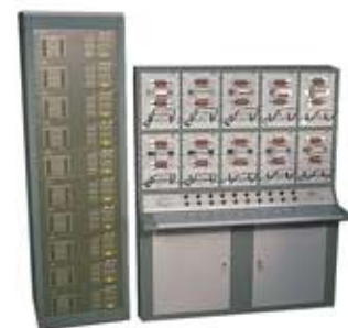
MCB Circuit Breaker Testing System