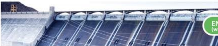
ENVIRONMENTAL TECHNOLOGY (water/waste water/recycling)