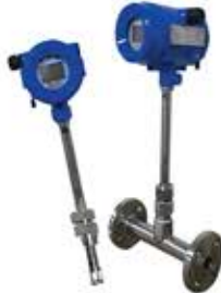
Thermal Mass Flowmeter