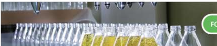
FOOD AND BEVERAGE INDUSTRY