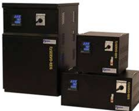
Single Phase Voltage Stabilizer 1 KVA - 50 KVA