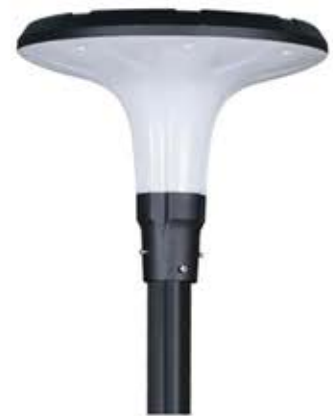
Solar Courtyard Light