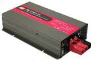
Stationary Battery Charger