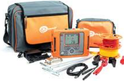
Earth Resistance Meters (3P – 4P – two clamps)