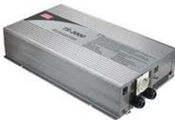
True Sine Wave