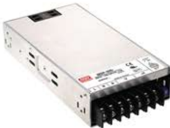
Medical Power Supply