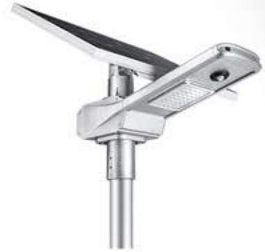
Split Solar Street Lighting