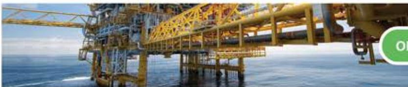
OIL AND GAS INDUSTRY