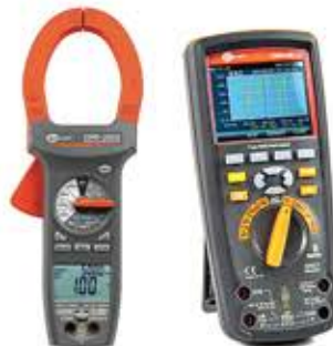
Clamp Meter & Multimeter