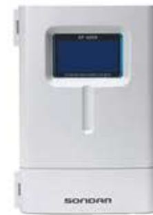
Open Channel Flowmeter