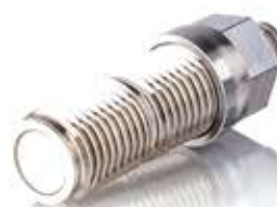
Piezoelectric Pressure Sensor