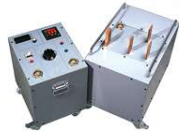
Primary Injection Test Equipment