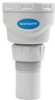
Ultrasonic Level Meter

توفر شركة SONDAR الكورية مجموعة كبيرة من أجهزة قياس المستوى المتطورة والتي تعتمد على الموجات فوق الصوتية (Ultrasonic)