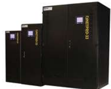
Online UPS 45 KVA - 800 KVA