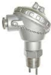
Thermal Flow Switch