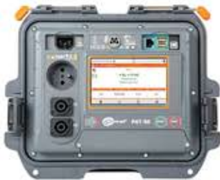
Portable Appliance Tester