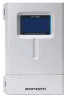
Ultrasonic Sludge Level Meter