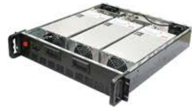
Rack Power Unit