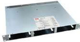
Rack Battery Charger