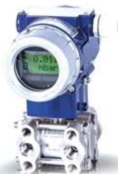
Differential Pressure Transmitter