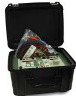
Secondary Injection Equipment for Relay Testing